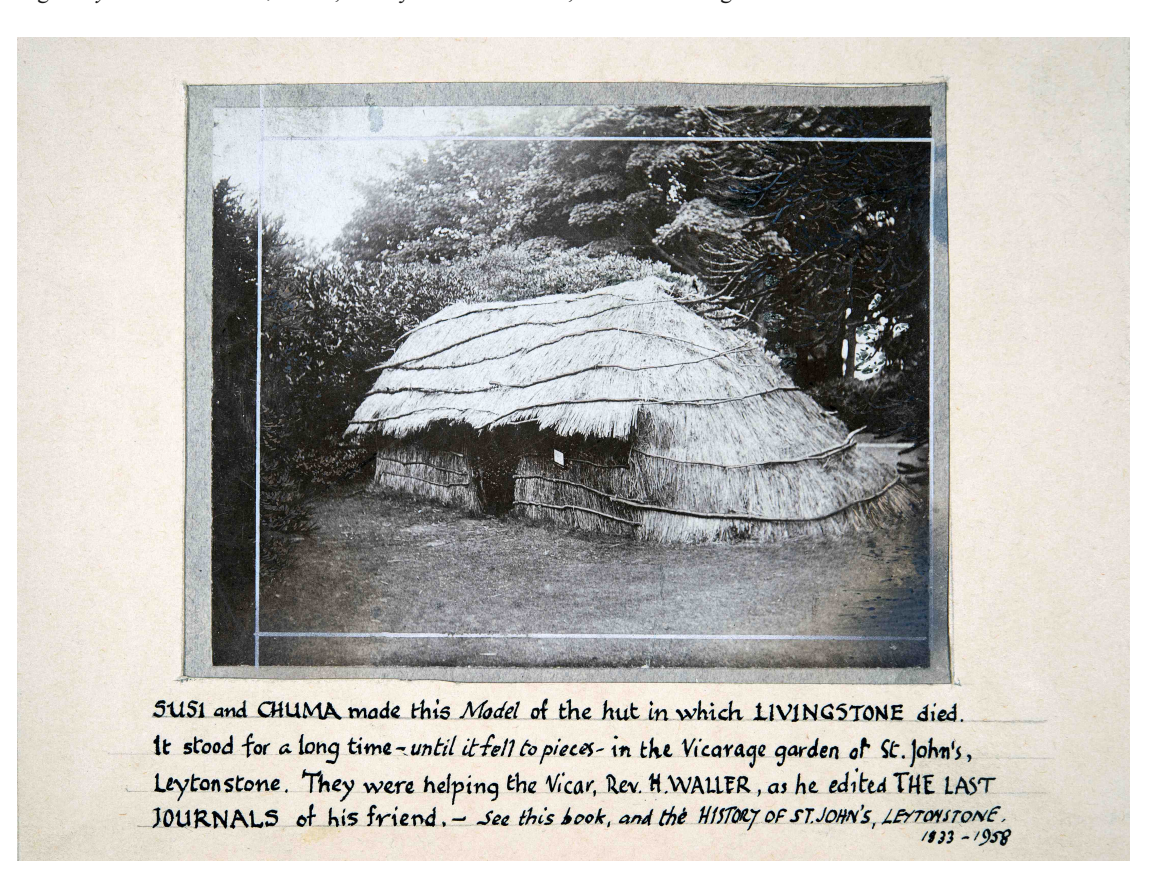
Fig 2. Model of the Hut in which David Livingstone Died.